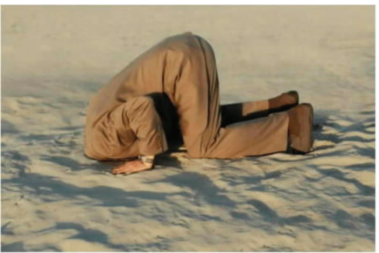
Id. (citations omitted; images in original).